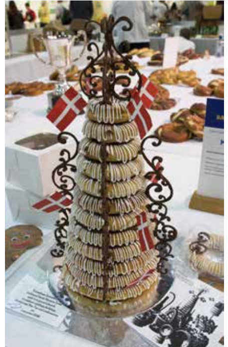
● Krakenkake by Copenhagen Bakery