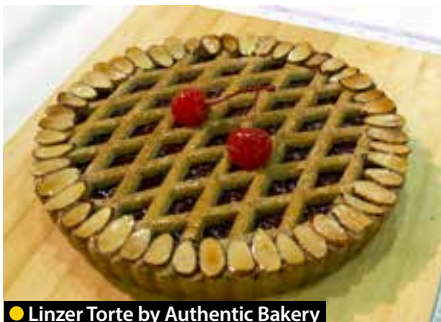
● Linzer Torte by Authentic Bakery