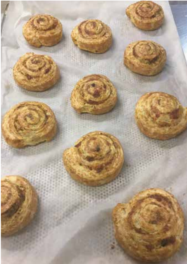
Yield: 12 scone scrolls.