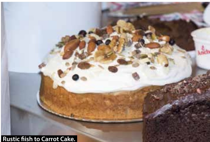
Rustic fish to Carrot Cake.