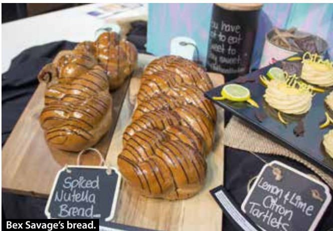
Bex Savage's bread.