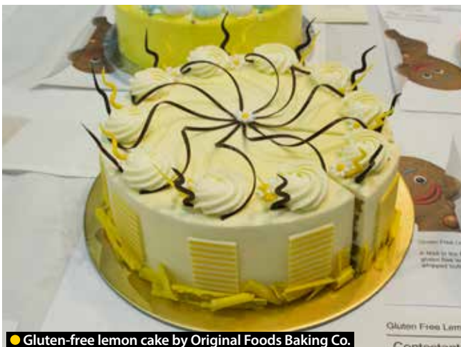
● Gluten-free lemon cake by Original Foods Baking Co.