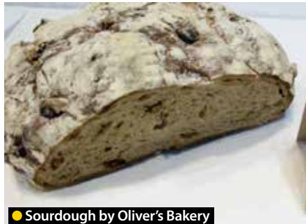
● Sourdough by Oliver's Bakery