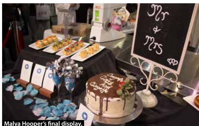
Malya Hooper's final display.