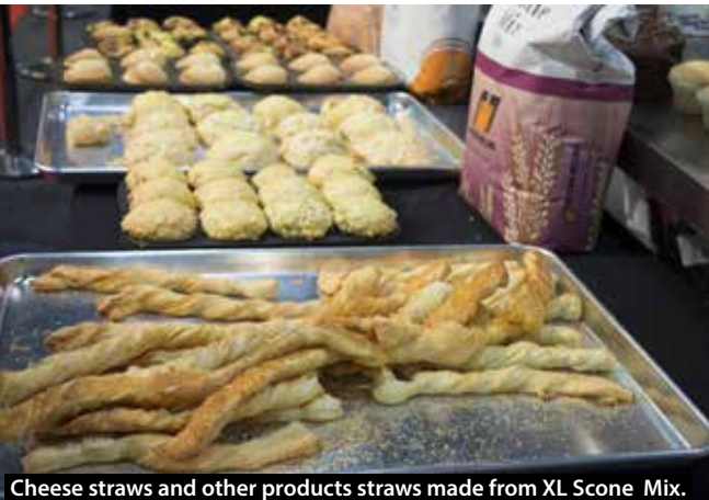
Cheese straws and other products straws made from XL Scone Mix.