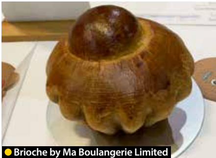
● Brioche by Ma Boulangerie Limited