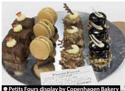
● Petits Fours display by Copenhagen Bakery