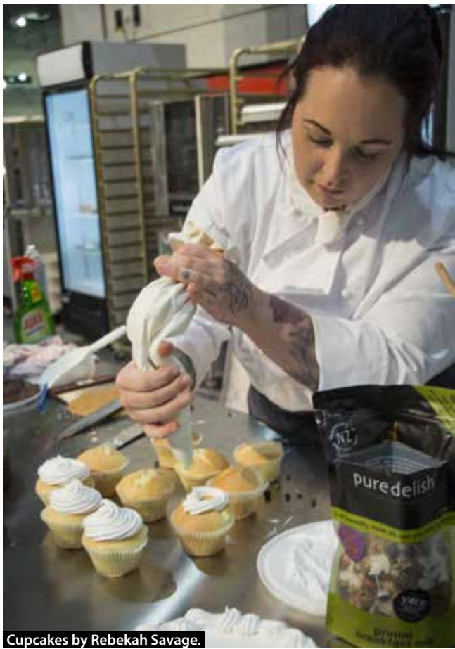
Cupcakes by Rebekah Savage.