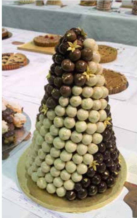
● Croquembouche by Ten O'Clock CBC