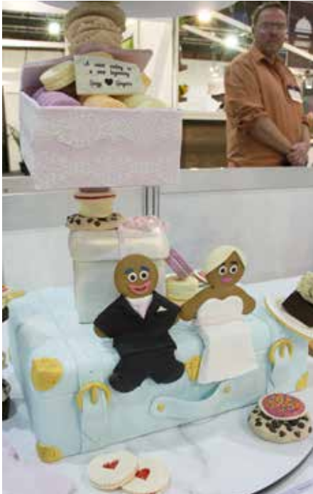
● Wedding cake (detail) by Melody's New World