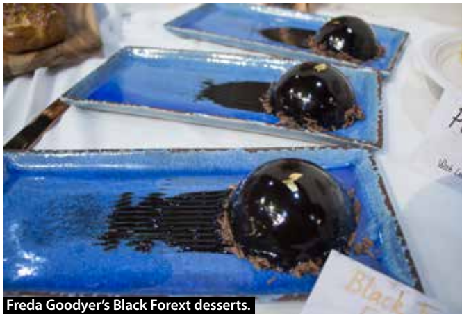
Freda Goodyer's Black Forest desserts.