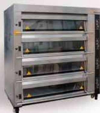
4 Deck Oven