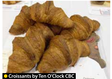
● Croissants by Ten O'Clock CBC