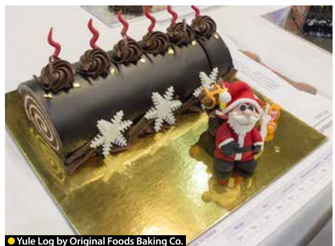
● Yule Log by Original Foods Baking Co.