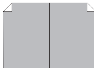
Double Page Spread Trim size: 420 mm wide x 297 mm high + 3 mm bleed each edge

Prices are for print ready material as per specifications below. Requested positions may carry 10% loading. Prices are non-commission bearing. All placements subject to availability. Inserts/onserts based on single A4 sheet.