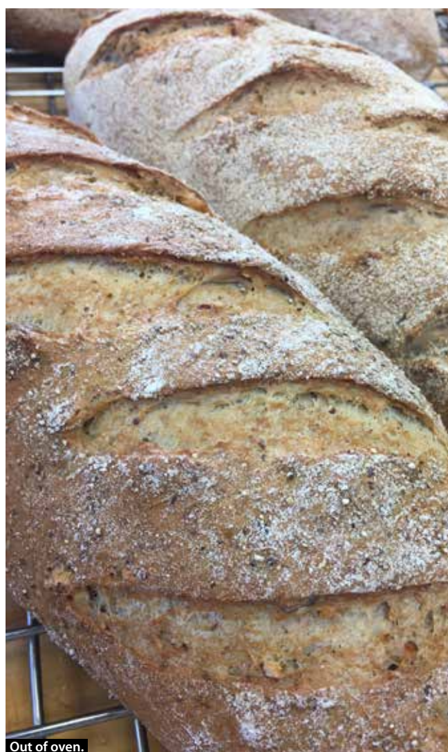
Out of oven.