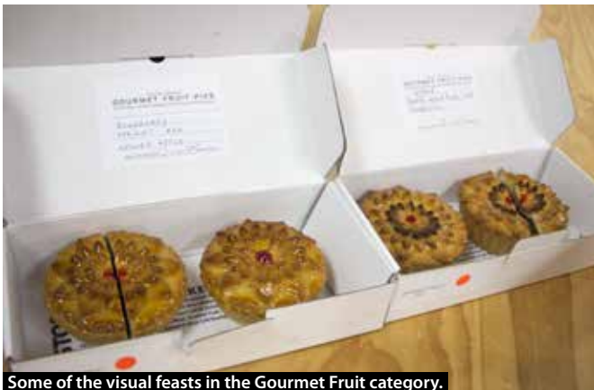
Some of the visual feasts in the Gourmet Fruit category.