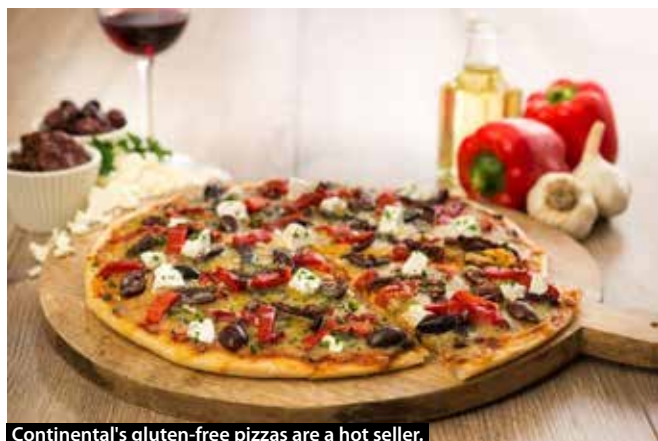
Continental's gluten-free pizzas are a hot seller.

Demand has skyrocketed since Continental grabbed the opportunity to convert its original bakery and production kitchen area in Rangiora into a 100 percent gluten- and allergy-free space.