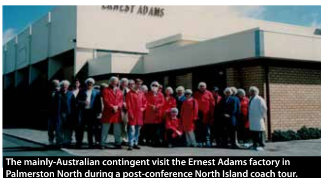
The mainly-Australian contingent visit the Ernest Adams factory in Palmerston North during a post-conference North Island coach tour.