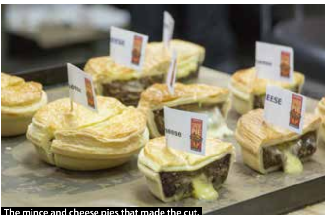
The mince and cheese pies that made the cut.