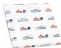
Anchor Food Professionals Butter Sheets

We welcome our fellow BIANZ members to contact us with any queries about our range. Please call 0800 ANCHOR to set up a meeting with one of our Anchor Food Professional team members.