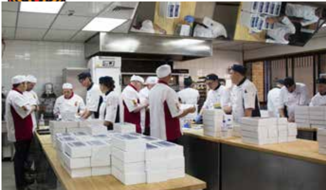
Just some of the judging. There are two rooms like this to get through the thousands of entries.

Judging a pie by its cover (or rather its pastry) is the first job for the judges at the Bakels Supreme Pie awards judging day. Tasting a few is the last.