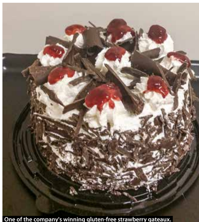
One of the company's winning gluten-free strawberry gateaux.