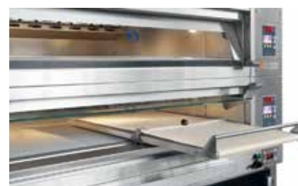
Setter Loader - Optional