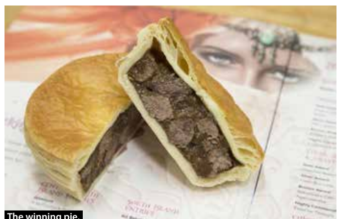
The winning pie.