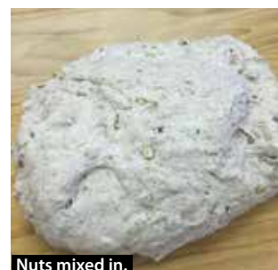
Nuts mixed in.