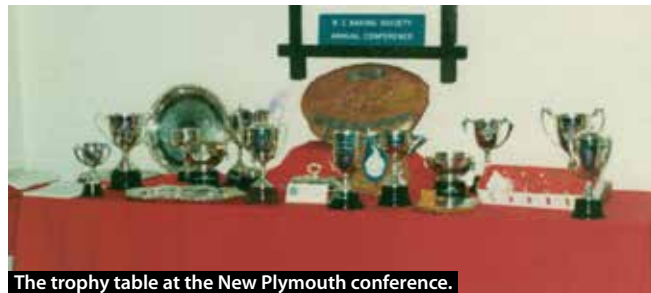
The trophy table at the New Plymouth conference.

The world has changed radically since the Baking Society was formed. Wage negotiations are no longer a national sport, retail bakeries sell coffee, most Kiwis know their brioche from their croissant, and supermarkets employ craft bakers. Still, craft and specialist bakers, even quite large businesses, remain in need of the support only an organisations like BIANZ can offer.v